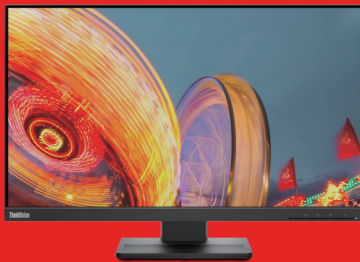
Accurate colors with 99% sRGB color gamut