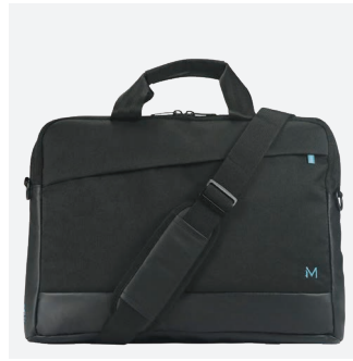
Adjustable and removable