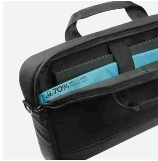
With reinforced laptop compartment