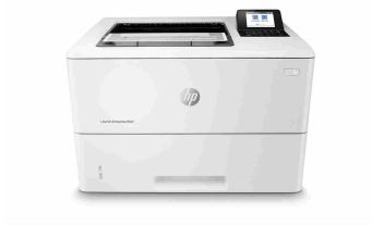
HP LaserJet Enterprise M507dn

Choose an HP LaserJet Enterprise printer designed to handle business solutions securely and efficiently, and helps conserve energy with HP EcoSmart black toner. Keep up with the demands of growing business with a printer you can rely on. 1