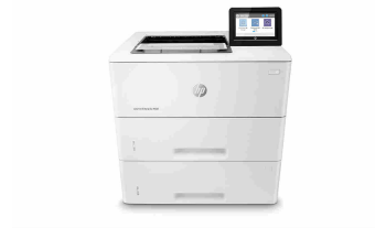
HP LaserJet Enterprise M507x

This printer is intended to work only with cartridges that have a new or reused HP chip, and it uses dynamic security measures to block cartridges using a non-HP chip. Periodic firmware updates will maintain the effectiveness of these measures and block cartridges that previously worked. A reused HP chip enables the use of reused, remanufactured, and refilled cartridges. More at: http://www.hp.com/learn/ds