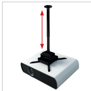
Adjustable drop in 25mm increments for the easy positioning of projector height