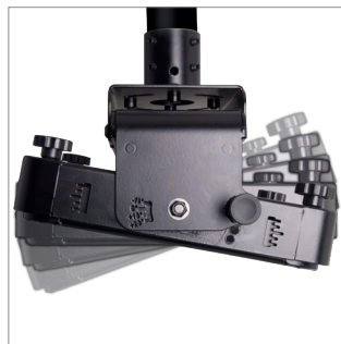
Features easy, incremented tilt adjustment