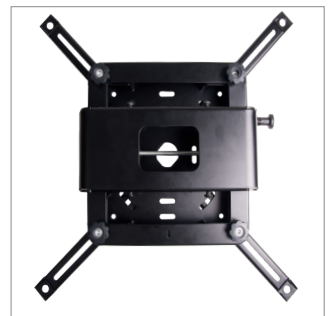
Optional extension legs can be used to accommodate larger spacing patterns