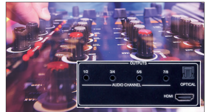
Embed / de-embed any of the 7 audio inputs