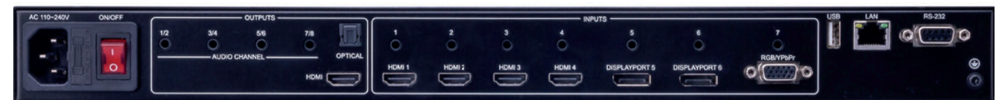
Its deceptively simple appearance disguises its extremely powerful abilities as a 4K Multiviewer / Presentation Switcher.