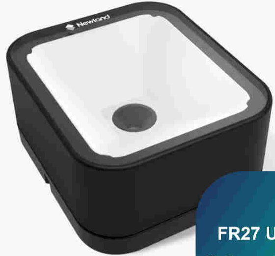
FR27 Urchin Stationary Scanners