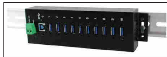
Din Rail Mounting

This manual may make reference to trademarks, registered trademarks, and other protected names and/or symbols of third-party companies not related in any way to StarTech.com. Where they occur these references are for illustrative purposes only and do not represent an endorsement of a product or service by StarTech.com, or an endorsement of the product(s) to which this manual applies by the third-party company in question. StarTech.com hereby acknowledges that all trademarks, registered trademarks, service marks, and other protected names and/or symbols contained in this manual and related documents are the property of their respective holders.