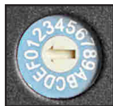
Rotary Dip Switch

The Rotary Dip Switch is located on the front of the Transmitter and Receiver .