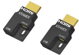
Figure 1: HDMI Connector plugs (Source and Display)

The CLS-AOCH/60-XX / CP-AOCH/60-XX provides an extremely high quality signal over a wide range of resolutions, up to 4K@60Hz (4:4:4). This cable is available in different lengths from 33ft (10m) to 328ft (100m). The CLS-AOCH/60-XX / CP-AOCH/60-XX has a slim design to let you pull the cables easily (together with the supplied pulling tool) through small-sized conduits.