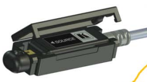
II: Close the Pulling Tool cover.