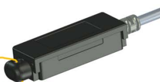
III: Insert the pulling cable through the Pulling Tool ring.