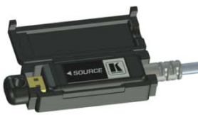
I: Place the micro HDMI connector inside the Pulling Tool.