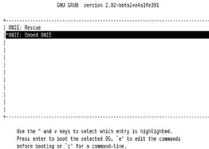
Figure 3. Embed ONIE menu