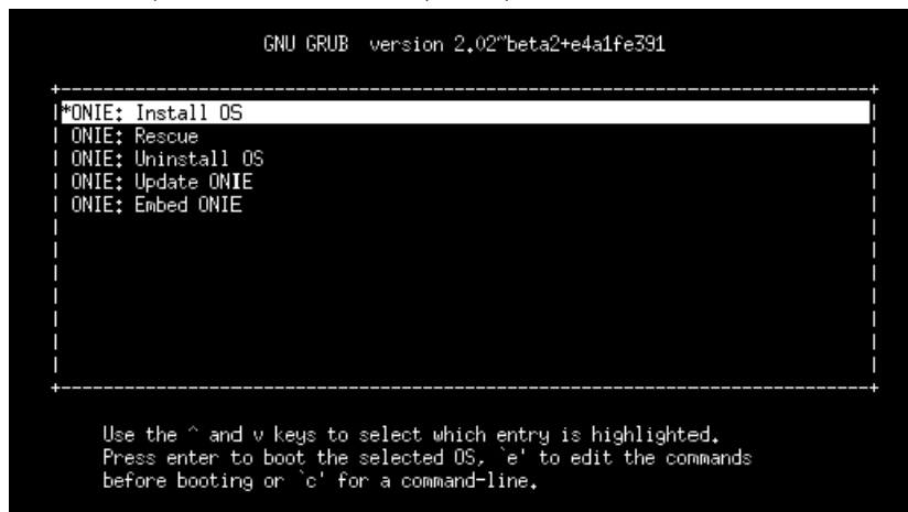
Figure 4. ONIE install menu

After the Embed-ONIE installation completes, the system boots up and presents the ONIE menu.