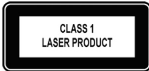
Figure 1. Class 1 laser product tag