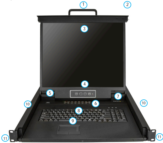
*actual product may vary from photos