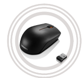
Lenovo 300 Wireless Mouse*