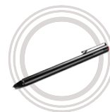
Lenovo Active Pen*