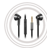
Lenovo 500 Extra Bass In-ear Headphones*