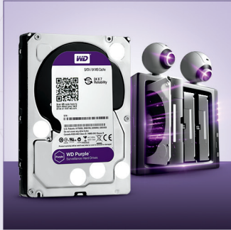
Balanced reliability, performance and cost storage.

WD offers a complete line of surveillance-class storage designed for home, small to medium business or mission critical security systems. These hard drives are engineered to support the rigorous 24/7, always-on, high-definition video requirement set unique to surveillance security systems. Choose a hard drive that is designed and engineered for surveillance systems and enjoy the peace-of-mind you can only get from surveillance-class storage.