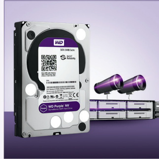
Purpose built storage for NVR Surveillance systems.