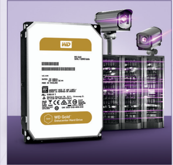
Maximum reliability and performance storage for large business and mission critical surveillance.