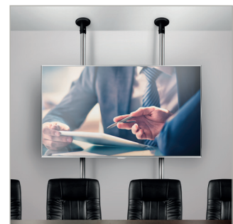
Compatible with B-Tech's collar and pole system for pole mounting heavy duty screens