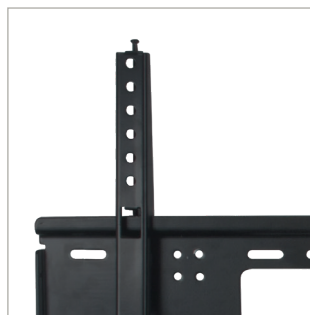
Adjustment screws allow screen to be levelled once mounted