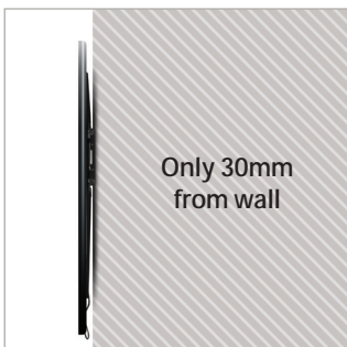
Ultra-Slim design mounts screen only 30mm from the wall