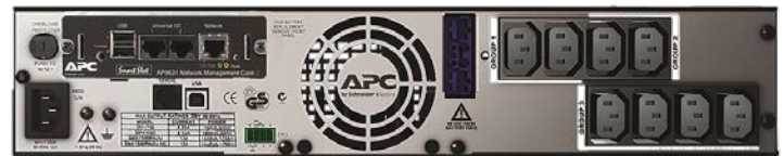
[ SMX1500RM12UNC ]