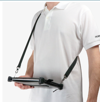
For typing in standing position

+ Shoulder strap attachment rings : Braided nylon, resistant to a 15kg traction per ring