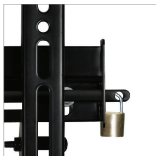
Locking bar for secure installation (padlock not included)