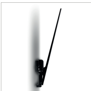
5 fixed tilt positions