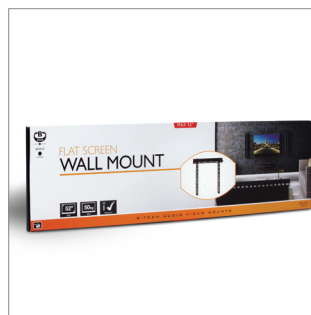
Supplied in retail packaging, ideal for the consumer market