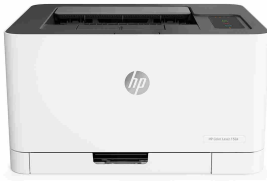
HP Color Laser 150a

Get productive print performance – world's smallest colour laser in its class. 1 Print, and scan, produce high-quality colour results, and print and scan from your phone. 2