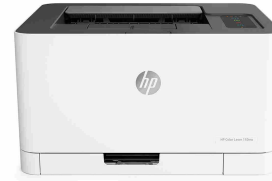
HP Color Laser 150nw

This printer is intended to work only with cartridges that have a new or reused HP chip, and it uses dynamic security measures to block cartridges using a non-HP chip. Periodic firmware updates will maintain the effectiveness of these measures and block cartridges that previously worked. A reused HP chip enables the use of reused, remanufactured, and refilled cartridges. More at: http://www.hp.com/learn/ds