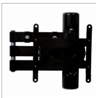
Space saving design - folds against the wall