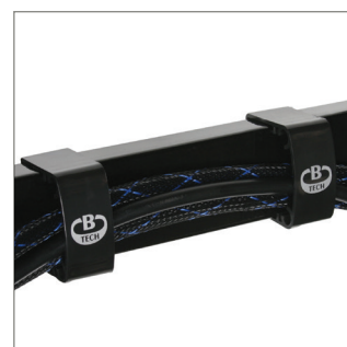
CLIPLOGIC™ cable management