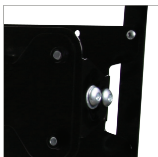
Security locking screws provided