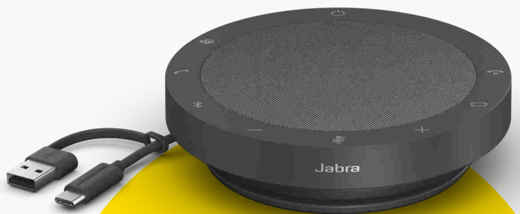
MS TEAMS & UC VARIANTS

We consider sustainability carefully at every stage of product development. The casing of Speak2 55 is made with over 50% sustainable materials**, and has a number of built-in parts that can be repaired or replaced. Better sustainability = longer speaker life = great calls for you and your team for years to come.