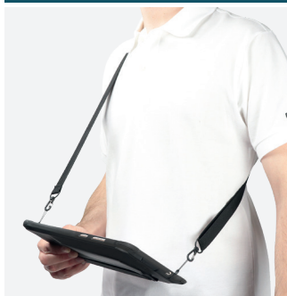
For typing in standing position