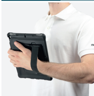
Portrait / Landscape layout