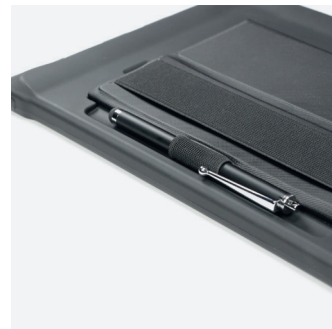
*Stylus not included