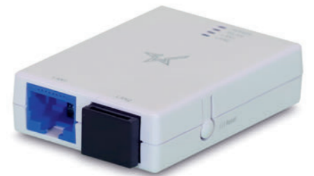
MCW10 Wireless LAN Module

The new TSP100IV from Star brings a unique new design for a truly revolutionary product. The quality and reliability of the popular TSP100 series has been fused with enhanced connectivity and specialist printing features for the very latest in point of sale and omni-channel commerce. For the ever-changing retail environment, the TSP100IV has every angle covered!