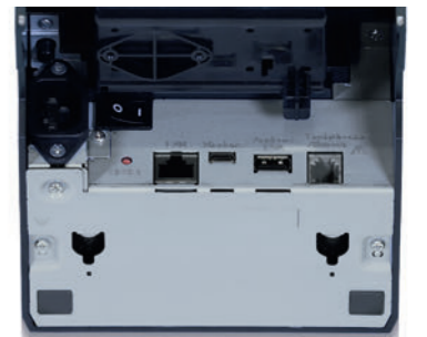
TSP100IV Multi-Connectivity Interfaces