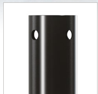
Features safety bolt holes at the top and bottom for secure installation