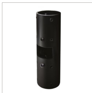
Poles can be linked together using BT7823 & BT7824 Pole Joiners