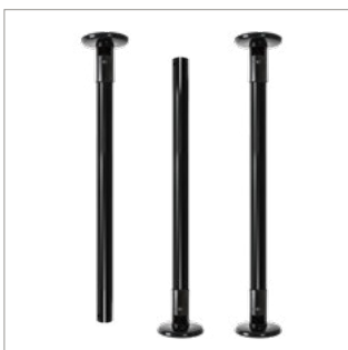
Can be mounted from floors, ceilings or both for more mounting flexibility