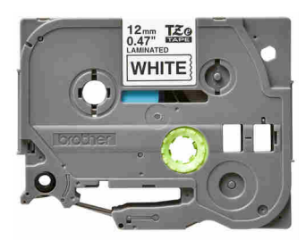
5 x Tape Cassettes