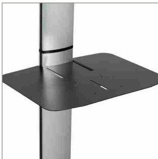
Designed to be mounted directly to the XRTROLLEY