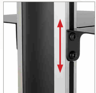
Simple installation and height adjustment