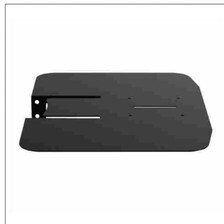
Slim-line profile with a weight capacity of up to 5kg