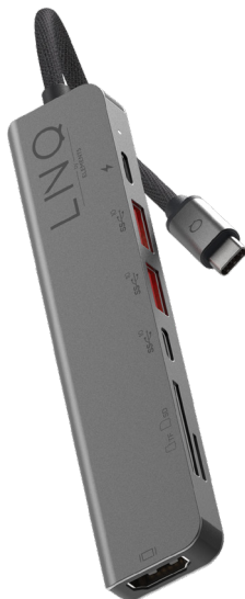
7 in 1 Pro Multiport Hub Model #: LQ48016