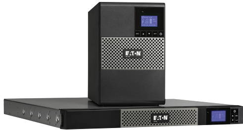
Available in tower and rack 1U format