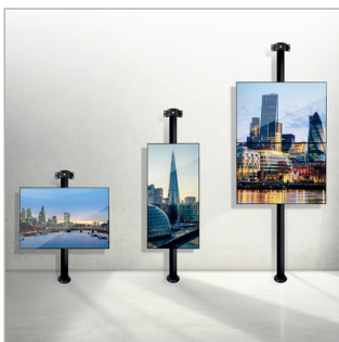
Compatible with B-Tech Ø50mm poles