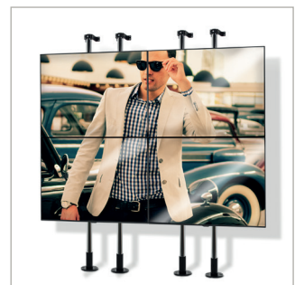
Ideal for creating multi-screen pole mounted installations - such as video walls