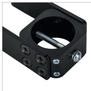
Includes safety bolt and grub screws for extra safety