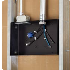
Zip tie Anchor Points