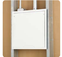
Paintable Flanges and Covers