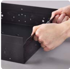
Break Away Edges

Chief engineers talked to customers like you about in-wall boxes and your biggest headaches on the construction site. Then they designed all new in-wall boxes to solve those headaches with multiple depth and ordering options.