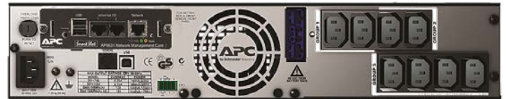
[ SMX1500RM12UNC ]