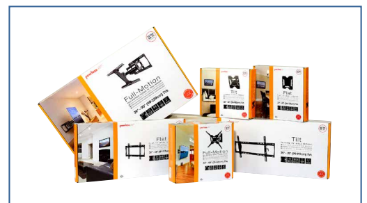
Comes in color packaging with included installation hardware and easy to follow instructions.