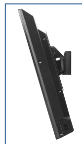
15°/-5° of tilt for versatile viewing angles.

Please visit peerless-av.com/en-us/patents for patent information.