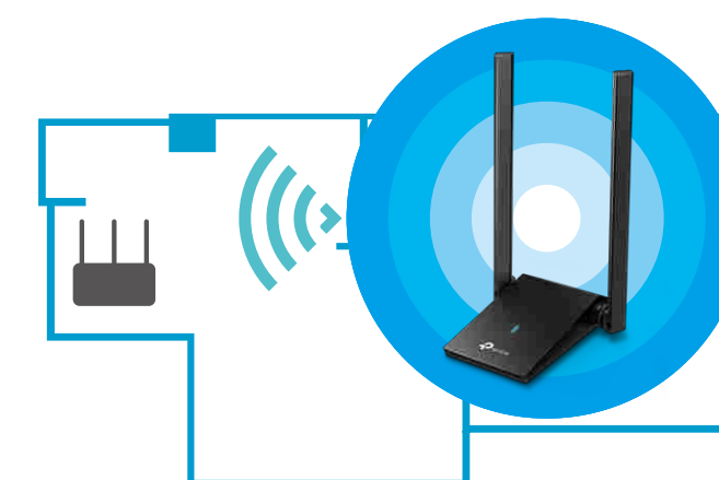
Archer TX20U Plus