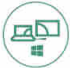
Extended Display Casting