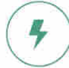
High Security Encryption