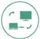
Intuitive Remote Control