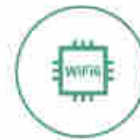
Wi-Fi 6 Chip