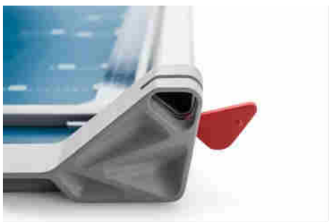
Dahle 508 rotary trimmer (3rd generation) - replace cutting heads easily with undetachable locking mechanism