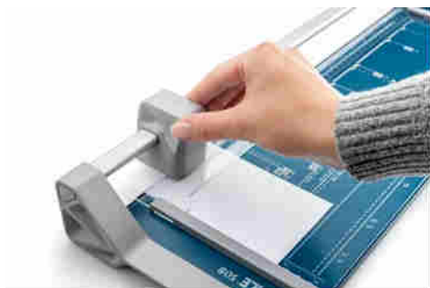
Dahle 508 rotary trimmer (3rd generation) - simple to use with two fingers thanks to improved cutting head ergonomics