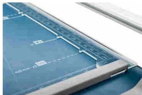
Dahle 508 rotary trimmer (3rd generation) - practical format lines and pressure clamp with markings make it easier to align the material to be cut