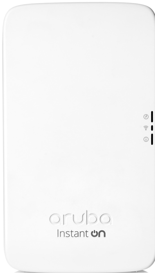
Aruba Instant On AP11D Desk/Wall Access Points

Whether you own a small law office or a trendy boutique hotel, your employees and customers are relying on the network for almost everything they do. And because Wi-Fi plays such a crucial role today, you need a purpose-built solution that keeps your business on the go. Aruba Instant On Access Points (APs) are easy to deploy and manage—with a quality look and feel at an attractive price point.