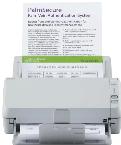
Dependable day to day scanning