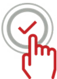
One touch operation

Market-leading technology, over 50-years experience and a reputation for quality and reliability have made Ricoh the world's most trusted scanner brand.