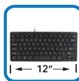
Space Saving Design

The membrane key switch features more than five million lifecycles, and its silicone rubber material can reduce noise when typing, offering a faster and quieter typing experience.