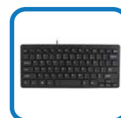
78-Key Compact Size