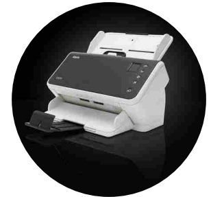
Alaris S2050/S2070 Scanners