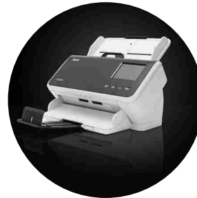
Alaris S2060w/S2080w Scanners