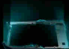
Anti Gravity Plate

Combining the 60 and 80 heat pipes, the Composite Heat Pipes stably transfer the heat in the most efficient way not only under daily applications, but even under heavy loading conditions such as extreme overclocking.