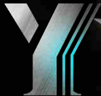
Y Formula Fins

The brand new Gale Hunter Fan is thicker and bigger in size for strongest airflow. With winglet on the fantail, the airflow will be concentrated and vortex effect can be avoided. The advanced Gale Talon design on the fan blades further brings the air to the thermal module in a smooth and stable pattern.