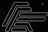
Exquisite Metal Backplate

A large copper base processed with anti-oxidation technology is adhered with both the GPU and DRAM to effectively absorb heat.