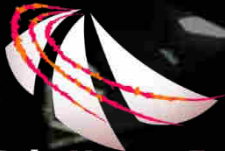
Gale Hunter Fan

The simple yet sophisticated black crystal design shows the high-class gaming style of its user. Looking closer, you'll find the twinkling stars are plucked out of the sky and embedded in the cooler surface, making the GameRock OmniBlack a real art piece and a powerful gaming gear even with no RGB lights.