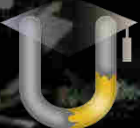
Composite Heat Pipes

An absolute blending of tech and art. The Exquisite Backplate comes with golden ratio cut-outs for maximized air venting efficiency. The engraving and gloss highlight on the plate add a flash of brightness in the midnight.