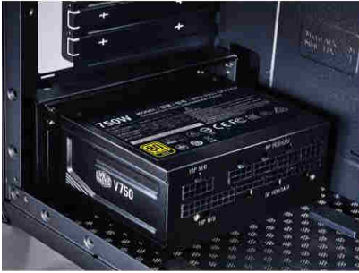
SFX Form Factor