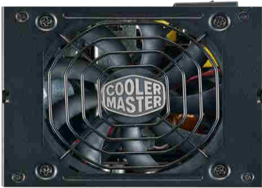
Quiet FDB Fan