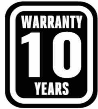
10 Year Warranty