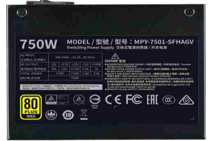
80 PLUS Gold Certified