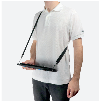
For typing in standing position