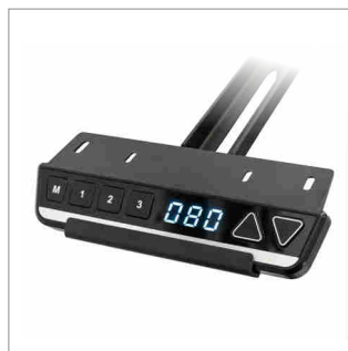
Supplied with a wired control panel