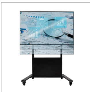
Height adjustment range of up to 650mm