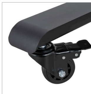
Includes non-marking 3" locking/braked castors