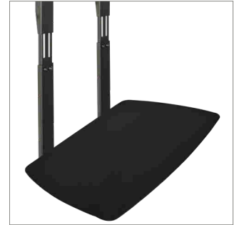
Large shelves such as the BT7032 can be mounted using 2x BT7031