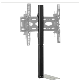
Allows mounted accessories to be positioned above or below the screen