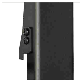
Can be adjusted to fit a variety of B-Tech mounts