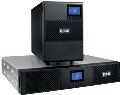
9SX Rack & Tower models