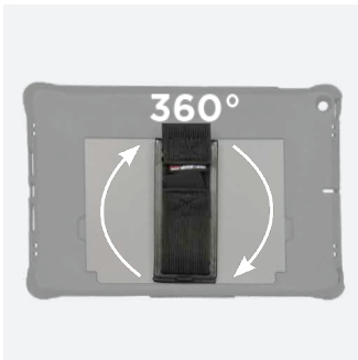
Rotating system 360°