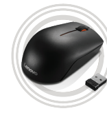
Lenovo 300 Wireless Compact Mouse