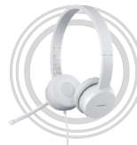
Lenovo 110 Stereo USB Headset