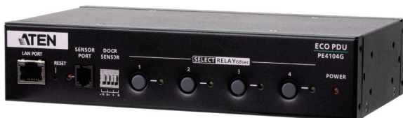
PE4104G Front View