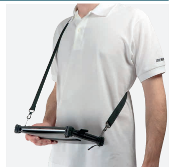
For typing in standing position