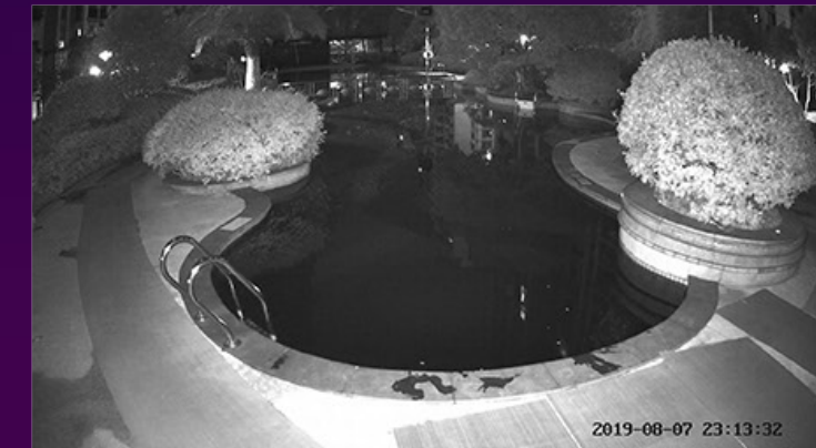
Traditional Black/White Vision

*In extreme environments, such as a completely enclosed warehouse or rural areas in a moonless cloudy night, the C3X will shift to black/white mode to ensure utmost image clarity.