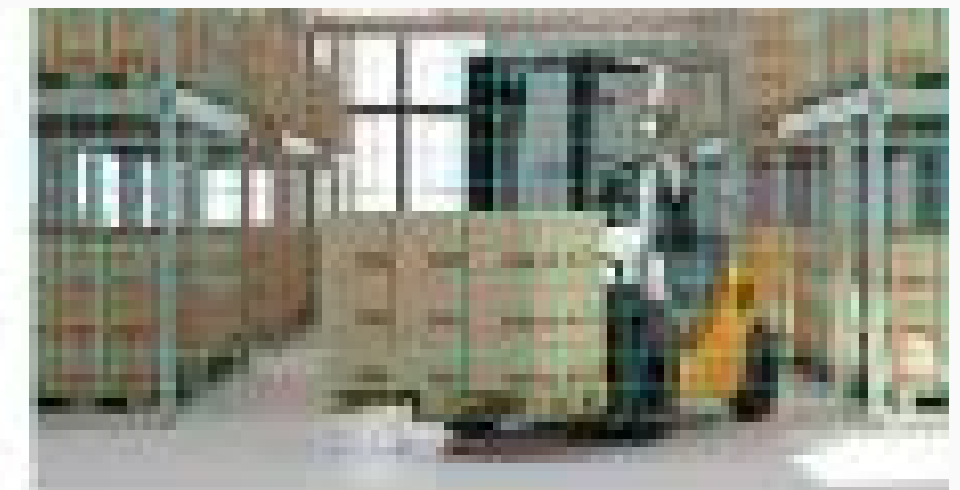
H.265 (Upgraded Video Compression)