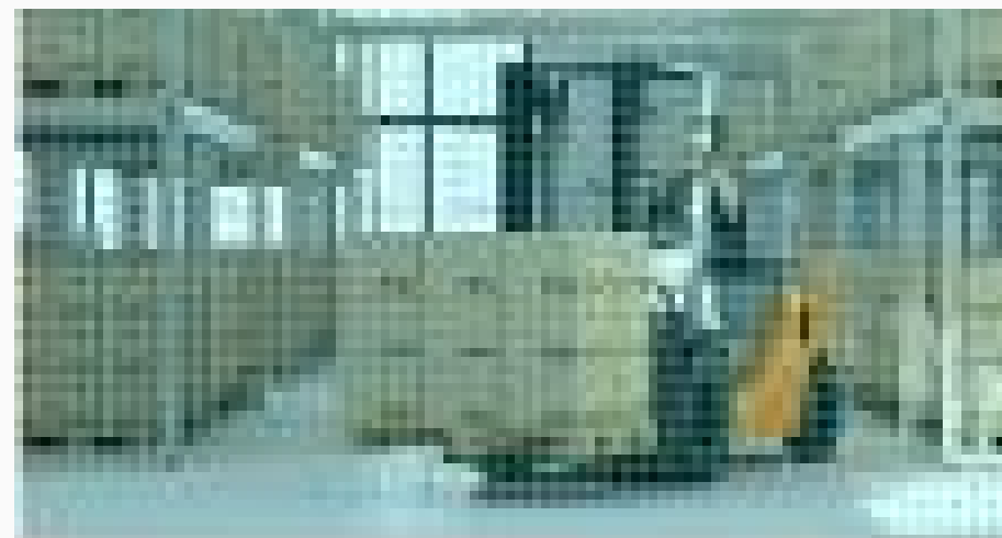
H.264 (Mainstream Video Compression)

Using the latest H.265 video compression technology, the C3X renders clearer and smoother video while reducing the need for data storage space and bandwidth.