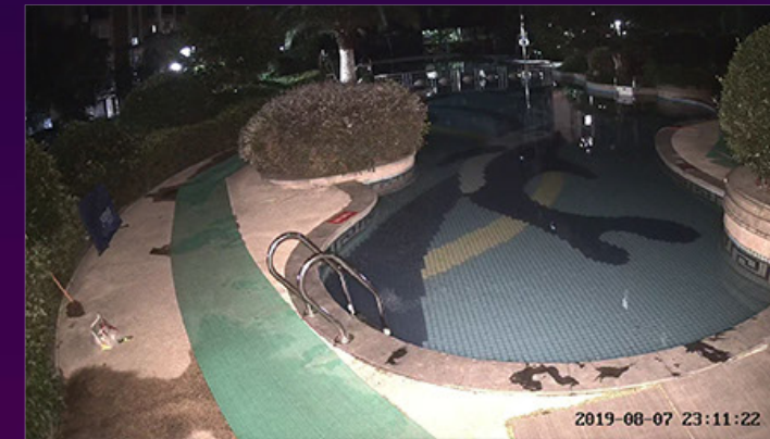
Night Vision with Built-in LEDs