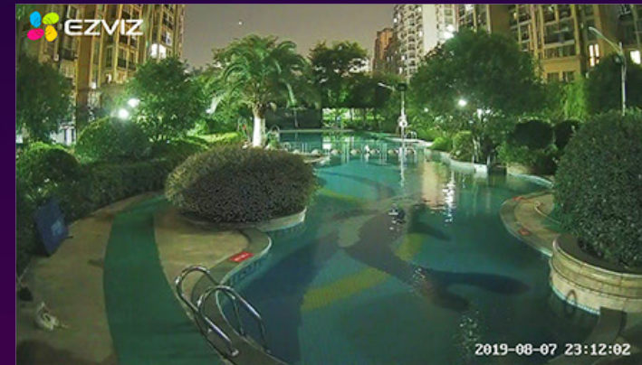
C3X Night Vision*

Leveraging supplemental lights to achieve color night vision was brilliant – until the introduction of the C3X. The C3X uses dual lenses and dual infrared lights to render better color images even in the lowest light conditions. There's no need for spotlights. C3X's colors are more natural, and the image is more evenly-illuminated.