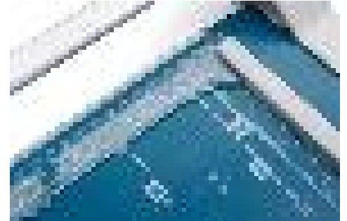
Dahle 507 rotary trimmer (3rd generation) - practical format lines and pressure clamp with markings make it easier to align the material to be cut