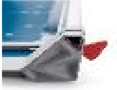
Dahle 507 rotary trimmer (3rd generation) - replace cutting heads easily with undetachable locking mechanism