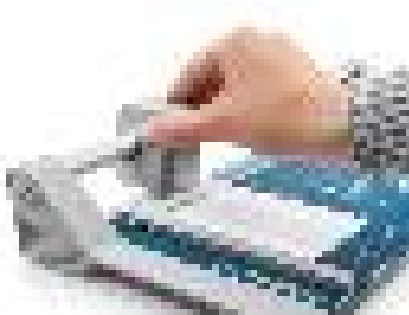
Dahle 507 rotary trimmer (3rd generation) - simple to use with two fingers thanks to improved cutting head ergonomics